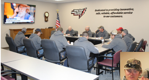
The office staff show their appreciation for our linemen by providing them all with a big breakfast spread.